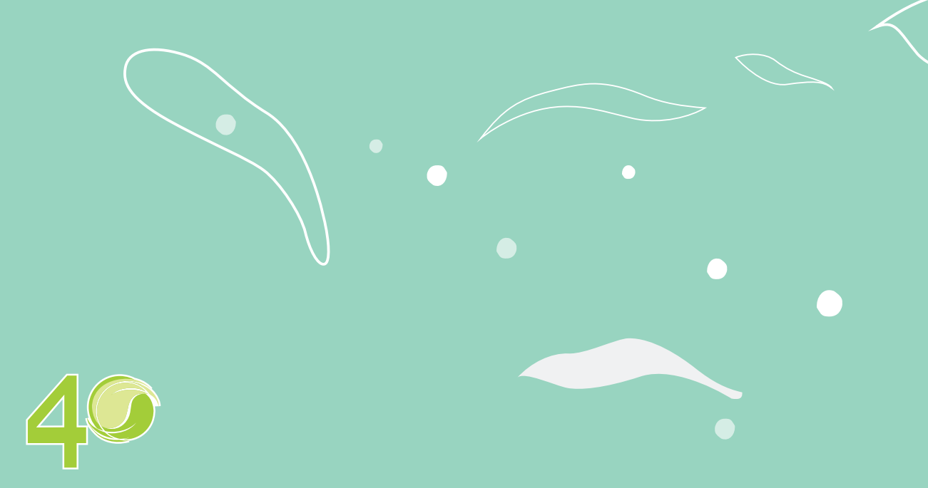
Landmark events of the Council in 40 years 消費者委員會四十周年大事誌